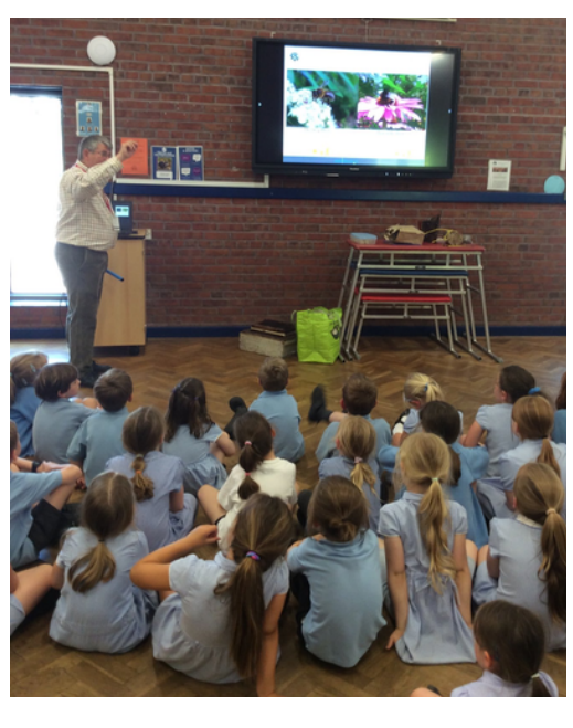
LEARNING THE IMPORTANCE OF BEES FROM A BEEKEEPER